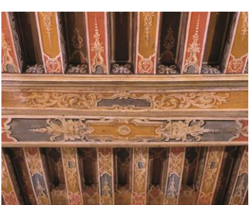
Figure 6: Italian Landscape in a cartouche adorn one of the beams on the ceiling of the Berlize hotel in the early 17 th century

-Fine-pieces: the Italian landscape with a sense of depth "Fig. 6", battle scenes with horsemen, deities ancient children playing or blowing trumpets, the owner figures with or without heraldic motif... Motifs that are also found in the painted paneling that grow under Louis XIII.