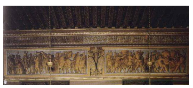
Figure 4: Detail of the ceiling of the hall at the hotel Sully (1630 – 1640)

The painter was always careful to alternate between them the decorations of the joists, which are typically two types in a room; some with central motif and the other with sides motifs "Fig. 4". This is reinforced by the alternating colored backgrounds, sometimes light and dark, brown and white, or two contrasting colors, for example green and red or blue, red and other lined with fine white stripes.