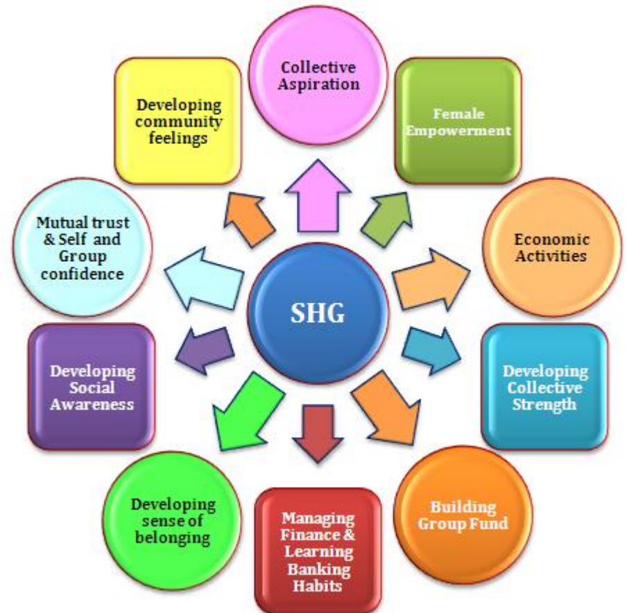
Model-1:- Functional Dimensions of SHG

SHG encourages women to form voluntary association and emerge as a group of saver-cum-borrowers. These groups develop habit of savings for its members. My study shows that saving is made on monthly basis. Depending on the economic status of the group members, women save Rs. 30 to Rs. 100. The sources of income for savings were found different, such as income from new business or micro enterprises (52%), family income (36%) and others. Majority of the respondents (69.28%) are able to continue their monthly savings on regular basis, whereas 30.72 per cent have failed to do so. The major reasons of such failure are family's poor economic condition, utilization of bank loan for other purposes, lack of group coordination and so on. Generally after 6 months of operation members are entitled to get loan. Government provide same amount of subsidy as they save for 6 months.