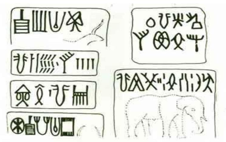
(Fig 4.Indus Valley texts)

(fig 4. Indus Valley texts)"Indus Valley texts are cryptic to extremes, and the script shows few signs of evolutionary change," Farmer and Witzel wrote in October 2000. "Most [Indus] inscriptions are no more than four or five characters long; many contain only two or three characters. Moreover, character shapes in mature Harappa appear to be strangely 'frozen', unlike anything seen in ancient Egypt, Mesopotamia or China." (Muthy)