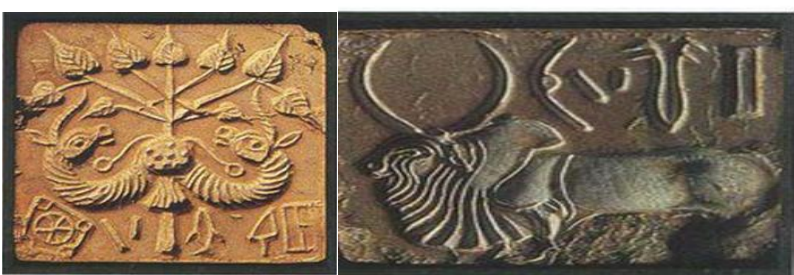
(Fig 2. seals)

Indus civilization, also called Indus valley civilization or Harappan civilization, the earliest known urban culture of the Indian subcontinent. The documentation of that time is on the seals. The seals and tablets have introduced examples of the pictographic script which still constitutes one of the major mysteries of the Indus Valley civilization. The script cannot be read, at present we can only predict certain rather arid principles about it (fig 2). There are many works on the decipherment of the script and on their solutions. This paper also compares its symbols with different signs and alphabets of different languages and carve out the most resembled language as Dravidian language, more experimental Sumerian script employs more than twice the numbers, is consistent with that on Egyptian analogy the hieroglyphic state; it has not degenerated nor been worn down by use to conventional summaries like Egyptian hieratic, the Babylonian cuneiform, or the Chinese writing. The inscription begins from right, but where there is a second line this begins from the left.