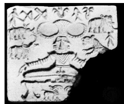
(Fig 3. seals)

How and when the civilization came to an end remains uncertain. In fact, no uniform ending need be postulated for a culture so widely distributed. But the end of Mohenjo-daro is known and was dramatic and sudden.