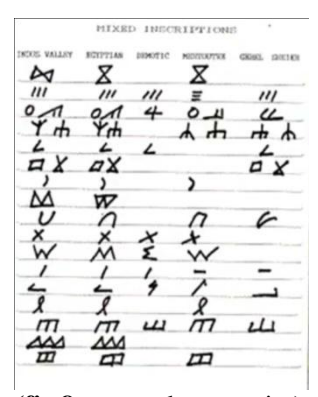
(fig 8 proto-saharan script)

It is clear that a common system of record keeping was used by people in 4<sup>th</sup> and 3<sup>rd</sup> millennium BC from Saharan Africa to Iran, China and the Indus Valley. The best examples of the common writing were the Linear A script, Proto-Elamite, Uruk script Indus Valley writing and then Libyco-Berber writing. Although the Elamites and Sumerians abandoned this writing in favor of the cuneiform script, the Dravidian Minoans, Mande and Olmecs continue to use the Proto-Saharan script.(fig 8)