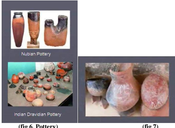
(fig 6. Pottery)

The Dravidian originated in Africa. They used the same red and black ceramics. Red and black pottery dates back to 4000 BC in Africa. It was used by many Kushitenations like Kerma, and C-Group.(fig 6)