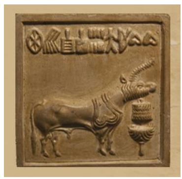
(fig 14 unicorn)

The god of the Harappans was the unicorn. The unicorn probably represented Mael this god was held in high esteem by the co herds and Sheppard. (fig 14)