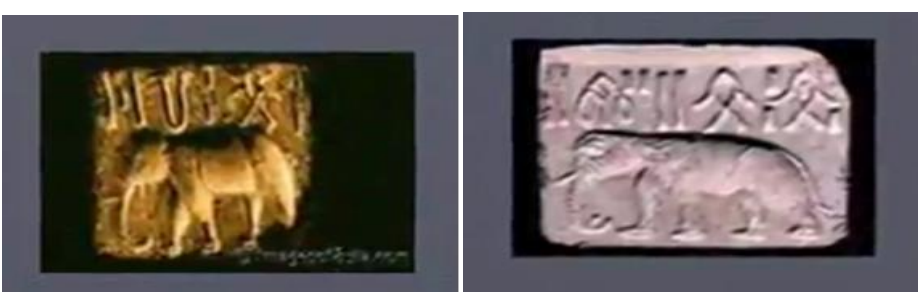
(Fig 13. Elephant)

The elephant on the Harappan seal may have represented Ganesa/Ganesha the elephant headed god of India. In the "Laws of Manu", it is written that Ganesha is the god of the "Shudras" the aboriginal population of India. The Termilian name for the elephant god is 'Pillaiyar, Palla and Veeram'. (fig 13)