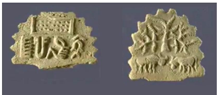
(Fig 15 double sided seal)