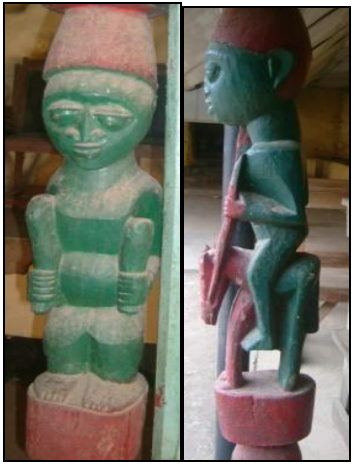
Figure 3: Elaborately decorated carved door with various palace scenes Figure 4: Carved pillar posts