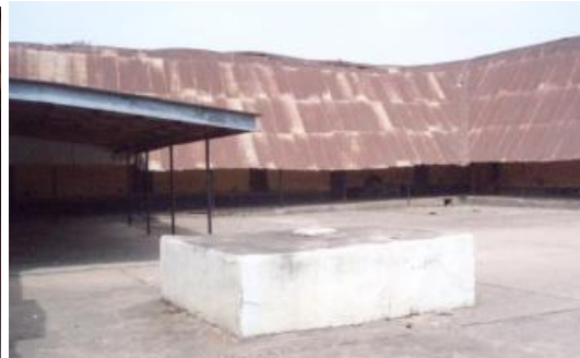
Plate 11: A stretch of corridor/veranda at the Oke-Emese Courtyard Plate 12: Ara 'lu (the elevated white platform)