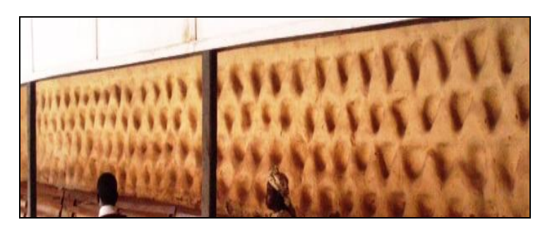
Plate 5: Hollowed pattern on a long-extended corridor at Oke-Emese courtyard. (2007)

is believed to have spiritual affinity with gongs. The gongs (six pieces) are of various sizes and designs. The tallest is about 1ft while the shortest is about 8.5 inches.