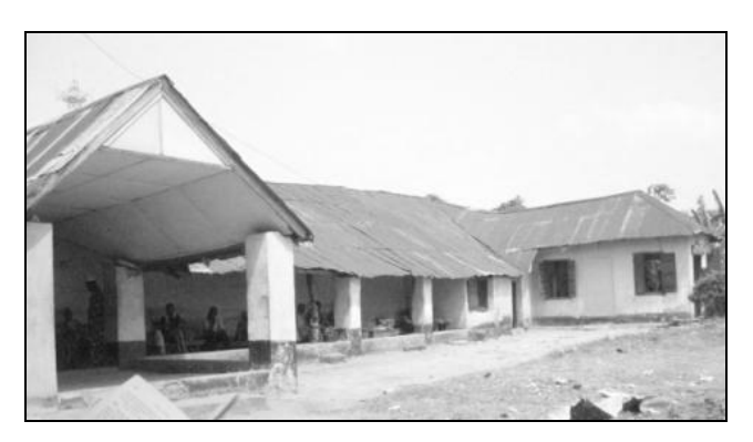
Plate. 1: A view of Owa's Palace. Photograph by Michael Olusegun Fajuyigbe (2007)

Ilesa is a Yoruba city-state located in the south-western geo-political zone of Nigeria, in the Yoruba Hills and at the intersection of roads from Ile-Ife, Oshogbo and Akure, which fall within Latitude 8.92°N Longitude 3.42°E. Ilesa, the capital of Ijesa kingdom and one of the larger Yoruba towns, was founded in the early 16th century. The city is situated in between the larger regional centres of Oyo and Benin, around the upper reaches of the Osun, Sasa and Oni rivers (Peel 1979). It is bounded in the south by the forest of Oni valley, in the north by Imesi-Ile, in the west by Osu and in the east by the Ekiti country. Located in the centre of two Ijesa Divisions (present Obokun and Atakumosa Local Government Areas), Ilesa is the metropolitan city of the Ijesa people. It is a classic example of a celebrated Yoruba town with a "crowned head"; it is ruled by a monarch bearing the title of Owa Obokun, Adimula of Ijesaland. The foundation history of the Ijesa people is similar to the "form of a dynastic migration from Ile-Ife, the sacred centre of Yoruba mythology". Peel (2002) asserts that Obokun, the youngest son of Oduduwa Olofin volunteered to fetch sea-water to cure his father's blindness. However when he returned, he discovered that his father had given his elder brothers all the crowns and treasures; hence, there was nothing left for him except a sword "ida ajase" (sword of conquest) which his father gave him to wage war against his enemies.