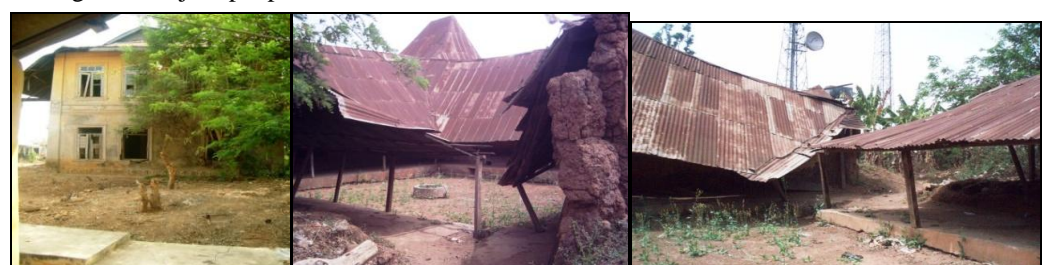
Plates: 6, 7 & 8: Abandoned structures and dilapidated courtyards.

Owa's palace - the old afin in particular - features several courtyards (akodi), verandas, porches, impluvia, drainage, rooms, roofs, doors and expansive gardens. The old palace structure is traditional in design, and the cultural artefacts referred to here are found in the old palace. The recent palace structure, located to the left side of the main entrance, is modern in design. Very little changes are noted in the old palace at Ilesa; sometimes, tourists are filled with awe and admiration, gazing at the architecture that is about seven centuries old. Walls, in some courtyards, remain as naked as they had been from primordial time. Its grandeur has seriously diminished due to a lack of maintenance culture (figure 6). It is therefore crucial to challenge all stakeholders about the need to salvage the situation without necessarily obliterating the evidence of rich cultural cum artistic heritage of the Ijesa people.