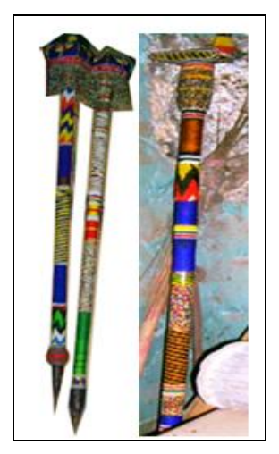
Figure 2: Beaded Royal Staff ( Opa Ase ) and Beaded Walking Stick ( Opa Ileke )

The royal paraphernalia are cultural objects that symbolise the authority of the Owa and present him as the royal father and the arch-priest of his people. Owa's art collections include ancestral and religious symbols, royal paraphernalia, and wood carvings that embellish the palace structures. These paraphernalia include the beaded crown, beaded collar, embroidered regalia, beaded staff, walking sticks, sculpted throne, ceremonial