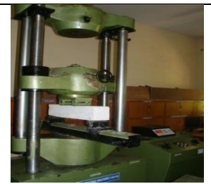
Fig 3: Loading diagram for flexure strength III. TEST RESULTS AND DISCUSSION

IOSR Journal of Mechanical and Civil Engineering (IOSR-JMCE) e-ISSN: 2278-1684, p-ISSN: 2320-334X PP 39-43 www.iosrjournals.org