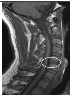
Fig.5:Herniation of disc