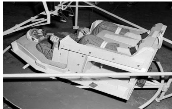
Fig.2: An astronaut sits in a spacecraft simulator in the zero-gravity position.

Inversion therapy is used to cure back pain caused by degenerative or herniated discs, spinal stenosis or other spinal conditions. The inversion condition cause gravitational pressure to be placed on the nerve roots, resulting in shooting pains in the back, buttocks, legs and feet. During inversion therapy, you turn your body upside down to increase the space and reduce pressure between the vertebrae and nerve roots. Inversion Table is an adjustable platform which allows positioning in an upright or inverted position in order to allow the effects of gravity to meet requirements to cure the disorders related to spine. Frederick Sheffield designed a tilt table with a highly-polished slippery top on which the patient was attached by a pelvic harness. By tilting the table head down or inverted.