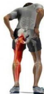
Fig .6: sciatica affected positions