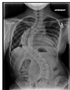
fig.4:X-ray view of Scoliosis