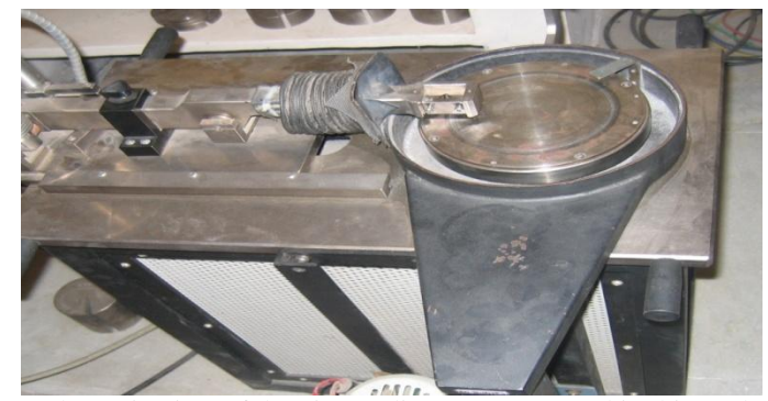
Fig. 1 Schematic view of the pin-on-disc apparatus used in this study.

International Conference on RECENT TRENDS IN ENGINEERING AND MANAGEMENT 51 | Page Indra Ganesan College of Engineering