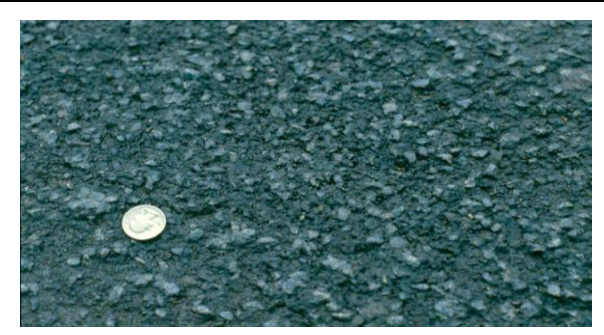
Fig 12. High severity ravelling of asphalt surface