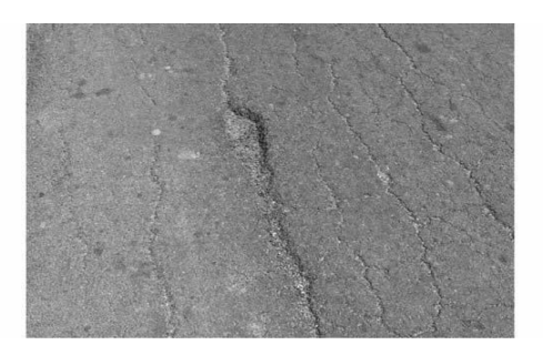
Fig 4. Longitudinal Cracking

Longitudinal cracks are long cracks that run parallel to the center line of the roadway. These may be caused by frost heaving or joint failures, or they may be load induced. Understanding the cause is critical to selecting the proper repair. Multiple parallel cracks may eventually form from the initial crack. This phenomenon, known as deterioration, is usually a sign that crack repairs are not the proper solution.