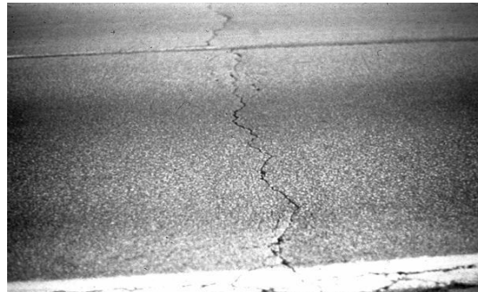
Figure 5. Low severity transverse crack.

Transverse cracks form at approximately right angles to the centerline of the roadway. They are regularly spaced and have some of the same causes as longitudinal cracks. Transverse cracks will initially be widely spaced (over 20 feet apart). They usually begin as hairline or very narrow cracks and widen with age. If not properly sealed and maintained, secondary or multiple cracks develop, parallel to the initial crack. The reasons for transverse cracking, and the repairs, are similar to those for longitudinal cracking. In addition, thermal issues can lead to low-temperature cracking if the asphalt cement is too hard. Figure shows a low-severity transverse crack.