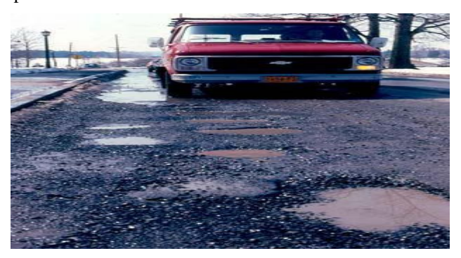
Fig 10. Potholes caused by poor drainage

Potholes are bowl-shaped holes similar to depressions. They are a progressive failure. First, small fragments of the top layer are dislodged. Over time, the distress will progress downward into the lower layers of the pavement. Potholes are often located in areas of poor drainage, as seen in Figure. Potholes are formed when the pavement disintegrates under traffic loading, due to inadequate strength in one or more layers of the pavement, usually accompanied by the presence of water. Most potholes would not occur if the root cause was repaired before development of the pothole. Repair by excavating and rebuilding. Area repairs or reconstruction may be required for extensive potholes.