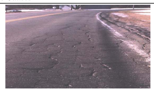
Fig 3. High severity alligator cracking