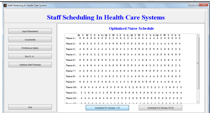
Figure 5.6 GUI windows when optimize staff schedule button is clicked