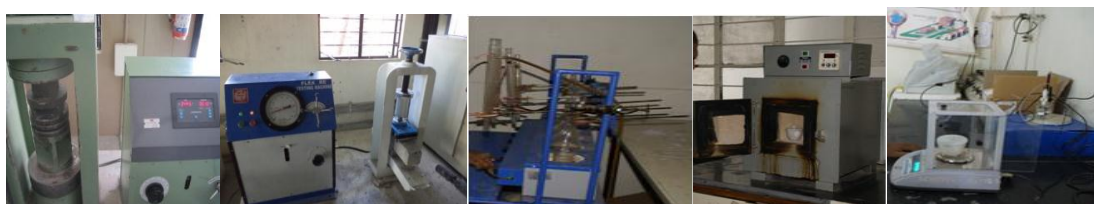
Figure. 3: Experimental set up for measuring strength of specimens and for chemical analysis

To find out Cl 2 , the powder samples were tested using Argentometric method in accordance with the provisions of the Indian standard specification [20].