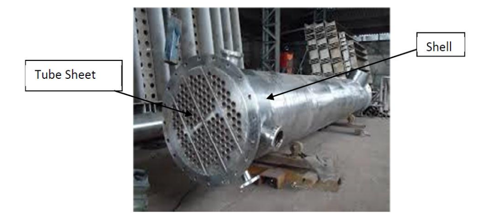
Fig 1. Assembly of shell and tube type of heat exchanger

The shell is the container which provides space for the exchange of heat between the two media. It houses assembly of tubes (Tube bundle) inside and remaining space for shell-side fluid. The shell has nozzles at its periphery for inlet and outlet for steam and water. The tube bundle has a large number of tubes which are decided on the basis of the capacity and purpose of the boiler for which it is designed. In a fire tube heat exchanger the hot flue gases pass through the tubes and have water or any other heat transferring fluid on the periphery. Tubes span across the length of boiler shell from the furnace side tube sheet to the channel side tube sheet. Tubes are welded to tube sheet on both the ends. Tubesheet is thick plate with multiple holes drilled in it. It has same number of holes as that of number of tubes in tube bundle. Steam drum is an external attachment which is connected to the shell through risers and down comer pipes. It holds feed water and steam generated in the process. It is a major component as it separates steam from water. Boiler shell, tube, tube sheet and steam drum are the major components of shell and tube type heat exchanger.