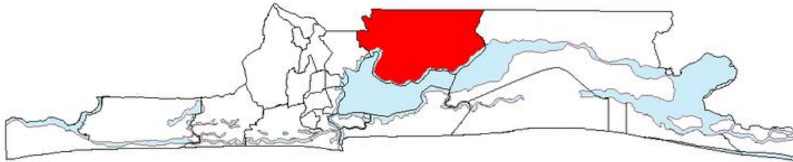
Figure 1 Map of Lagos State showing Ikorodu L.G.A

The clay in the area is mainly residual clay, deposited over the basement complex rocks of the project area. The residual clay was formed by surface weathering, which gives rise to clay by the chemical decomposition of the rocks, containing silica and alumina.