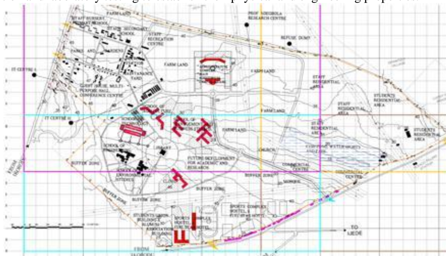
Figure 2. Plan of Lagos State Polytechnic

Field investigation and laboratory tests were conducted to obtain information on the underlying soils within the study area. The field investigations consist of various field activities carried out between end of 2012 and 2014. The field activities include six (8) numbers borings (BH 1 to BH 8) and 40 numbers Dynamic Cone Penetrometer Tests spread across the campus. Fig. 2 shows the campus general layout of the study area. [6]. The borings were accomplished using a light cable percussion (shell and auger) technique with a fully equipped motorized Dando 150 drilling rig. The Boring Tests were accompanied by disturbed and undisturbed samples. The field investigation revealed that closest groundwater level was at 9.00m below the ground surface. Soil samples were obtained and carefully prepared in the field and were transported to the laboratory for further visual inspection and laboratory testing to establish their physical and engineering properties.