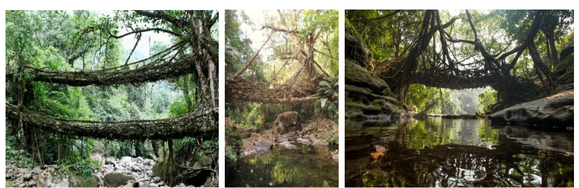
Figure1: Living Root Bridges, Meghalaya, India

This natural architectural concept was studied and coined as "Biomimictics" in 1969 by Otto Schmittin his article "Some interesting and useful Biomimetic Transforms". He has mentioned that some human problems can be solved using certain natural models <sup>[5]</sup>. In 1997, Janine Benyus describes Biomimictics as "a new science that studies nature's models and then imitates or takes inspiration from these designs and processes to solve human problems" and coined that nature should be approached as a model (study nature model and imitate its design), as a measure (judge the rightness – what works, what is appropriate) and as a mentor (new way of viewing and valuing nature) <sup>[6]</sup>.