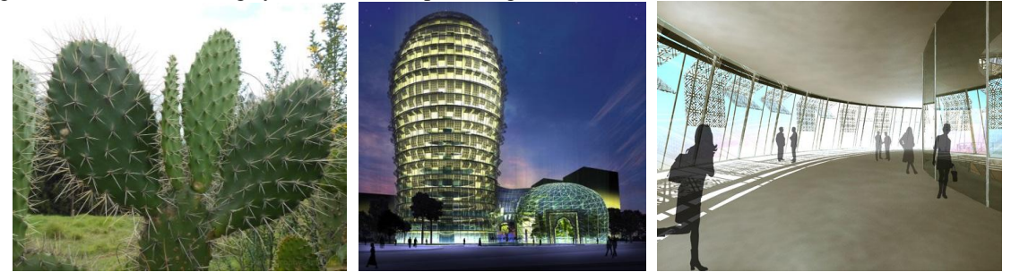
Figure 4: (a) Spines of Cactus plant, (b) MMAA Building, Exterior, (c) MMAA Building – Interior view.

The Organism Level refers to mimicking a whole organism or a particular portion of an organism. To mimic and produce a design with this level needs a little biological knowledge of the way the biology contribute and participate to the ecosystem. Cactus can be named as a best example for mimicking at organism level, since the plant can even grow in a dry climatic conditions (deserts) with the help of numerous spines that grows along the surface of the plant which not only protects the plant from animals, also they can collect water droplets from fog due to their conical shaped cross section and protects the plant from sun <sup>[3]</sup>. This concept was inspired by a designing company at Thailand named Aesthetics Architects. They designed a building for the new Minister of Municipal Affairs and Agriculture office (MMAA) in Qatar which has a dry and hot climate and an annual rainfall of approximately 3.2 inches. This building was designed based on the shading properties as like cactus spines in which the shades act like a filter which has the ability to an automatically fluctuate up and down, depending upon the desired interior temperature. This innovative solution allows this building to lower the usage of the artificial cooling system as well as providing a sustainable solution <sup>[13]</sup>.