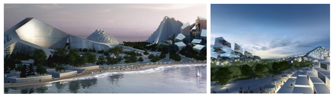
Figure 6: (a) Zira Island Master Plan, (b) Zira Island – Beshbarmaq, Savalan Building.

The Ecosystem Level refers to mimicking an ecosystem (i.e.) its principles, process and elements that are required for it to function successfully. This mimicking of the whole ecosystem leads to a concept called eco-mimicry. An advantage of this level was that it includes the other two levels of biomimicry (organism level and behaviour level). Mimicking a forest can be considered as an eco-mimicry. A forest live and grow by itself (i.e.) it takes everything from natural source, no need for artificial or external source. In such a way, an island was designed by BjarkeIngels Group (BIG) architects that act as a Zero Energy resort, situated within the crescent bay of Azerbaijan's capital Baku, on the Caspian Sea. They designed the whole island that produces enough energy to power the entire island with the help of the sun, the water and the wind. The island also contains desalination plant that converts salt water into fresh water. Photovoltaic panels were designed to be installed on the exterior facades and at the top of the buildings to generate power. With all of these concepts working together, the island becomes a self-sustaining, independent ecological system <sup>[9]</sup>.