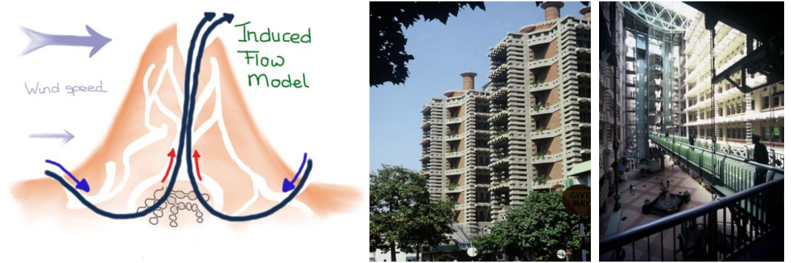
Figure 3: (a) Wind flow model in a termite mound, (b) Eastgate building, Zimbabwe, (c) Eastgate building, interior

Biology influencing design needs a detailed study of principle, properties, and the process of biology. This approach was initially dependent on people having clear knowledge about the relevant biological or ecological research rather than on determined human design problems. An example for this approach was demonstrated by Mick Pearce's Eastgate building in Harare. The building was based on termite mounds which have passive ventilation in order to create a thermally stable interior environment. Termite lives in tall mounds (26 feet in height and 10 feet underground) that can maintain the inner temperature constantly (around 85 degrees), even when the outer temperature varies from 104 F to 34 F. This was due to the structure of the termite mound is like a smokestack which consists of small openings or tunnels at the bottom that catch the prevailing breezes. The wet mud of the openings or tunnels lowers the temperature of the air through evaporative cooling <sup>[11]</sup>. Architect Mick Pearce used the termite idea as the basis for his design of the Eastgate Building in Harare, Zimbabwe. He developed an air - change system that uses a central atrium to passively move air from the base of the building to the stacks on the roof. Along the way, it passes through the hollow spaces under the floors and then into each office through baseboard vents <sup>[12]</sup>.