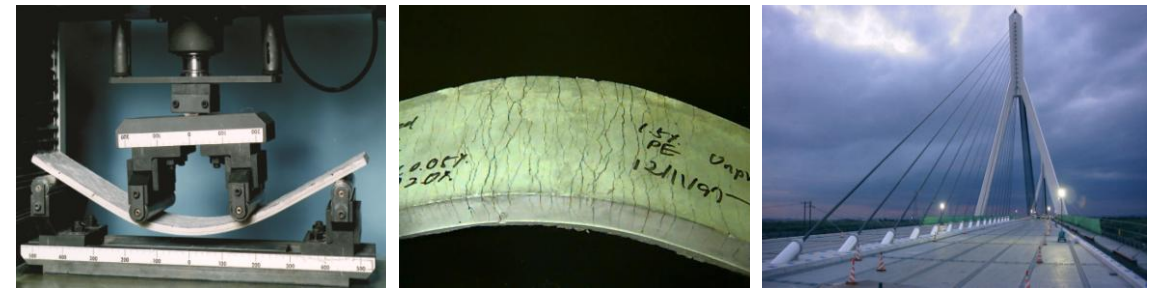
Figure 5: (a), 4 Point Flexural test on a concrete slab, (b) Concrete slab after flexural test (cracks formed due to bending and cured itself without any human intervention), (c) Mihara Bridge in Hokkaido, Japan.

In Behaviour level, it was not the organism itself that was mimicked, but its behaviour. As like organisms, several human organs also encounter various issues that tend them to change their properties naturally. The best example is the human skin, which has the property of bending, shrinking and expanding depends upon the need. In addition to this, whenever the skin was broken or cut, the tissues and the muscle cells, on each side of the wound start multiplying rapidly and build a "cell-bridge" across the gap results in a new skin. This self – healing and bending property of skin inspired Dr. Victor Li, University of Michigan. He developed a concrete known as an "Engineered Cement Composite" that bends instead of breaking and the cracks get cure by itself without any human intervention <sup>[2]</sup>. It uses microfibers that allow the final composite to bend with minimal fracturing and if fracturing does occur, the cracks near the dried concrete absorbs moisture from the air, makes the concrete becomes softer and eventually grows until the crack was filled in. At the same time, calcium ions within the crack absorb carbon dioxide from the air that results in the formation of calcium carbonate material that was similar to the material found in teeth and seashells. This regrowth and solidifying of calcium carbonate renew the strength of the cracked concrete. This increases the concrete's strength, durability and reduces premature cracking.