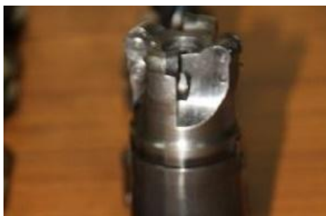
Figure.1 MRX cutter for face milling with round carbide insert.