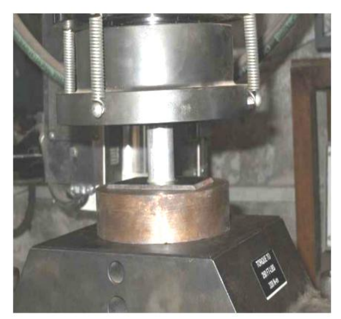
Figure 3.2 Extrusion Die Punch on Universal Testing Machine