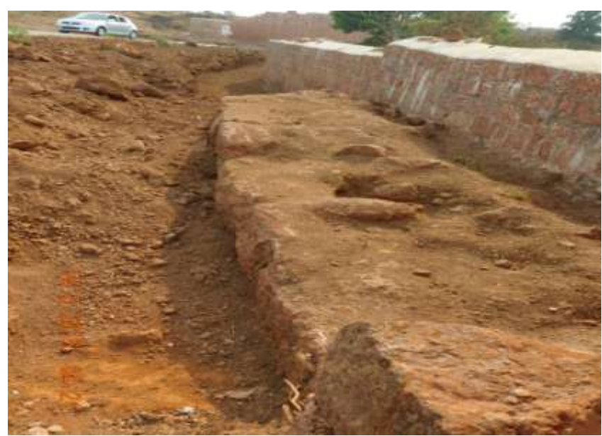
Fig.No 2: Excavation of buried structure at Bhudargad fort