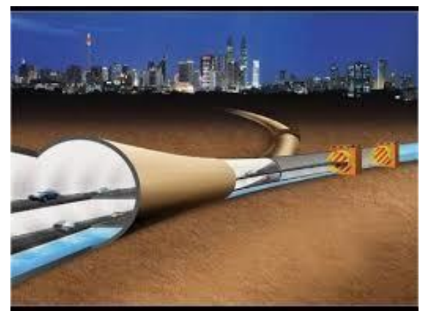
Fig 2. Animated view of SMART tunnel