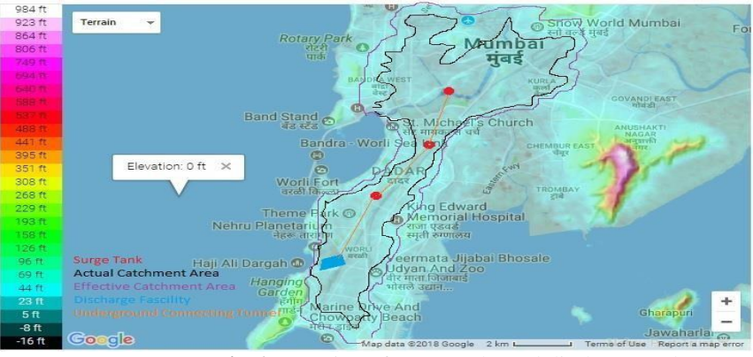
Fig 6: Location of surge tanks and discharge tanks

- Effective catchment area – 4 sq.Km (as calculated from fig.6).