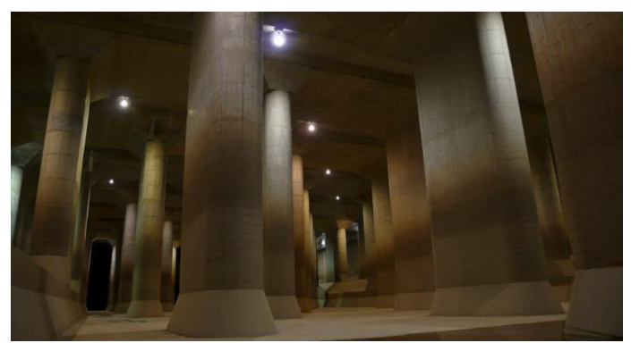
Fig.4 Interior of Temple Tunnel

The aim was simple: to take all the excess precipitation from disasters such as typhoons and floods away before it can cause any devastating impact. They implemented the project by construction of a big drain. However, the enormity and engineering complexity of the construction is staggering (fig.4)