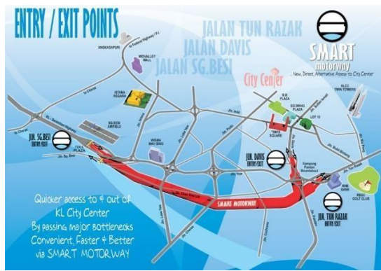
Fig 1. Entry and Exit points of SMART

The Storm water Management And Road Tunnel (SMART Tunnel), is a storm drainage and road structure inKuala Lumpur, Malaysia. It is a majornational projectin the country. The 9.7 km (6.0 mi) tunnel is the longeststorm waterdrainage tunnelinSouth East Asia and second longest in Asia. Fig.1 shows the SMART