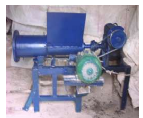
Fig 1: A picture of the experimental cassava pelletizer

hopper, heat exchanger barrel, reduction gear and the frame. Each component was designed following standard engineering principle [8].