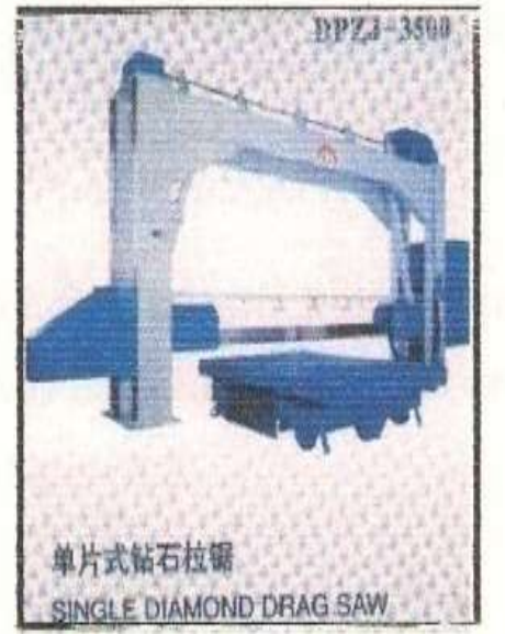
Figure 2 Granite Cutting Machine