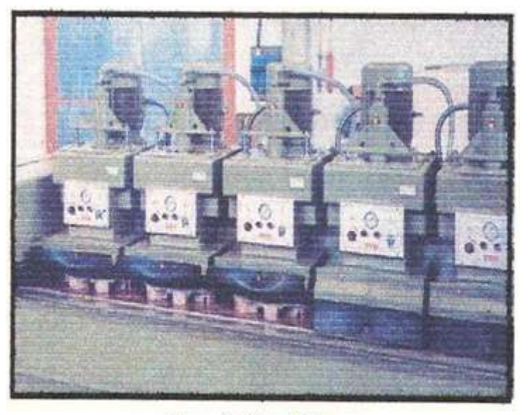
Figure 3 Autopolisher