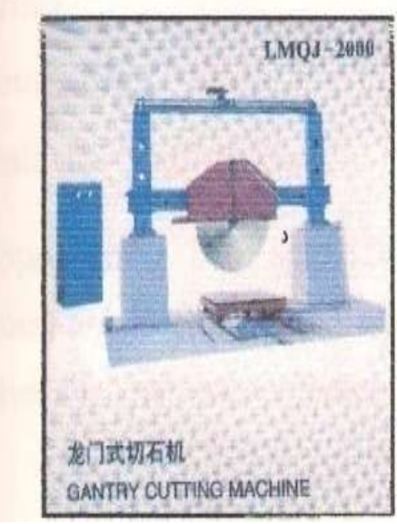
Figure 1 Granite Cutting Machine

The most important parameter in the selection of cutting fluids is the characteristics of machining process. Variety of machining processes would indicate relation between work piece materialcutting tool-chip combinations. The most difficult machining process will need to use more cutting fluid. The excellent literature survey in cutting fluids application provided same important data; machining processes were put in order according to the amount of usable cutting fluids quantity from the smallest amount to the highest amount.