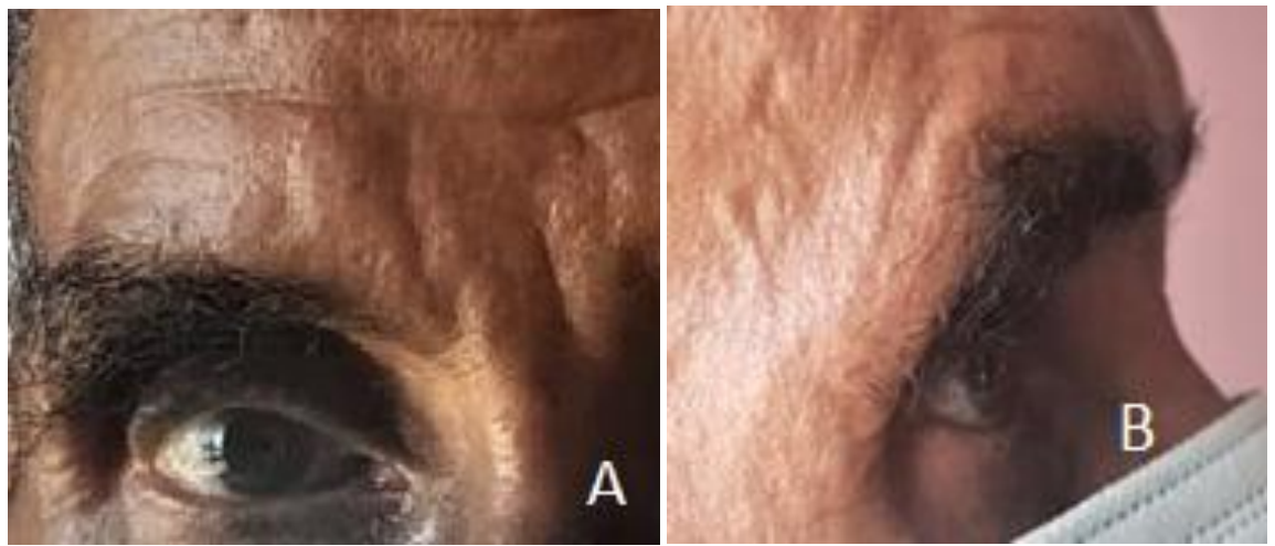
Fig. 1: Enophthalmos

This is a 65-year-old man with no particular pathological history who came to our consultation with a sensation of right exophthalmos that was bothersome and recurrent when prostrating during prayer, and had been evolving for more than 5 years. The ophthalmological examination revealed bilaterally corrected visual acuity of 9/10, and right-sided enophthalmos (Figure 1) which changed into painless exophthalmos when the head was tilted downwards (Figure 2). The rest of the eye examination was normal, with an IOP of 16 mmHg in the right eye and 15 mmHg in the left. An orbital MRI (Figure 3) was ordered, revealing dilatation of the right inferior ophthalmic vein and patent homolateral cavernous sinus veins. Additional scans, performed prone, showed further dilatation of the inferior ophthalmic vein with grade 2 exophthalmos. Given the absence of complications, a conservative approach was adopted with annual monitoring.