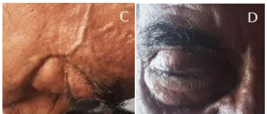
Fig. 2: Exophthalmos when the head is down

Orbital varicose vein, exophthalmos or enophthalmos? A case report