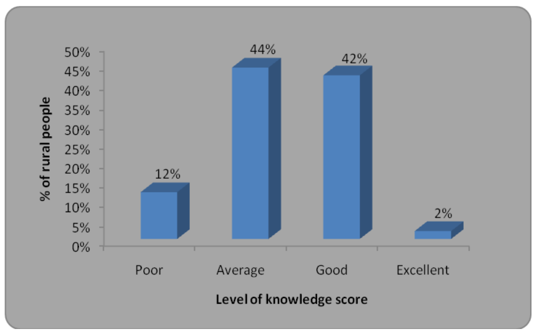
Graph 1: Distribution of rural people with regards to knowledge regarding dengue fever

The above table no 2 shows that 12% of the rural people had poor level of knowledge score, 44% had average, 42% had good and only 2% of them had excellent level of knowledge score. Mean knowledge score of the rural people was 9.74 \pm 3.26 and mean percentage score was 48.70 \pm 16.31 .