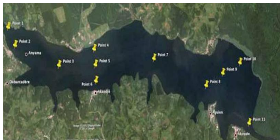
Fig.1: Sampling stations locations on Aghien lagoon, Côte d'Ivoire, Sampling stations (S1-S2-S3-S4-S5-S6-S7-S8-S9-S10-S11)