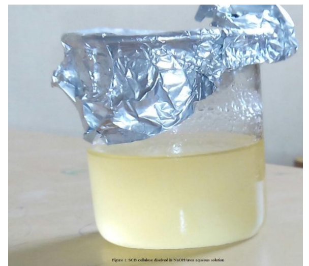
Figure 1: SCB cellulose dissolved in aqueous mixture of NaOH/urea

The white SCB cellulose obtained and the transparent liquid obtained by its dissolution in the aqueous mixture of NaOH/urea and the esterification product of its reaction with phthalic, acetic and maleic anhydrides were analyzed using FTIR and thermal analysis. The esterification route is given in scheme 1.