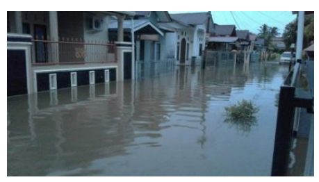
(a). Figure floods area house (b). Figure floods area house Figure 1: (a), (b) Citizen Housing