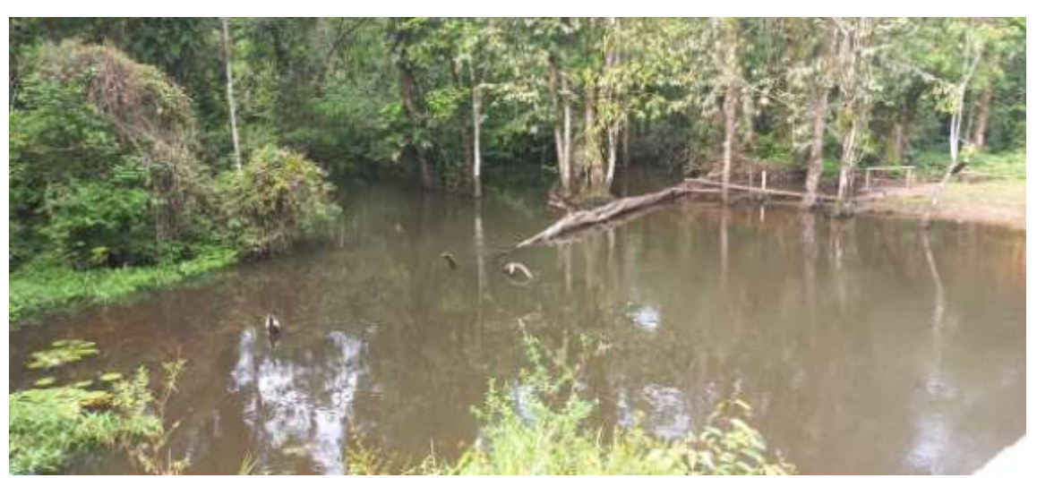
Maguari river. June 2023