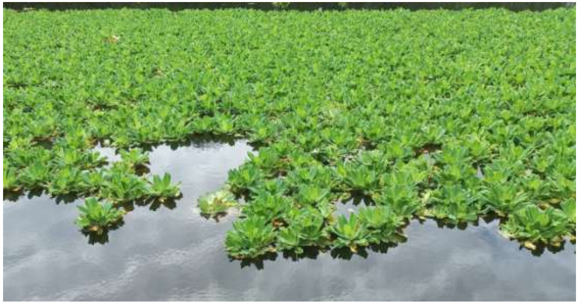
Caraparu River with eutrophication by Pristia stratiotes - June 2023

In June 2023, in the first incursion, a large quantity of free-floating macrophytes of the species Pristia stratiotes were observed in the Caraparu River, characterizing a large eutrophication in the area. It is noteworthy that in some of the team's forays into that river, city hall workers were observed removing large quantities of these macrophytes from the water to promote tourist use of the area, which occur in July. However, this mechanical removal of the large excess of this species has the positive point of reducing shading for other species and the siltation of certain areas of the river, close to the district of Caraparu, by foliage of this species and contributes to better oxygenation of the Caraparu River and its tributaries; as a negative point, mainly the reduction of shelter for some types of fish and availability of food and nutrients for other species, for example, macro-invertebrates and micro-invertebrates, among others. There is a need to identify whether eutrophication is natural or artificial; if artificial, it is necessary to identify the source to establish solutions to minimise harmful impacts on the river.