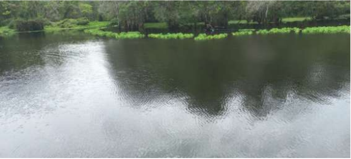
Caraparu river. June 2023

In collecting materials, the presence of bromine and lead was identified in both rivers, in addition to the presence of fluoride in the Maguari river and chromium in the Caraparu river. However, it requires more water collections at different tidal levels, periods, among others, to be able to assess whether it was seasonal or coming from some polluting source. It is observed that the presence of iron, nitrite, nitrate, copper, and mercury were not identified in the samples collected.