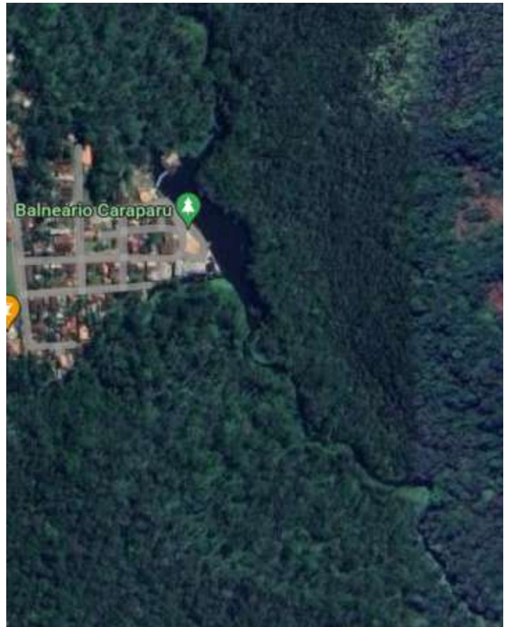
Caraparu River. Source: Google Maps<sup>4</sup>