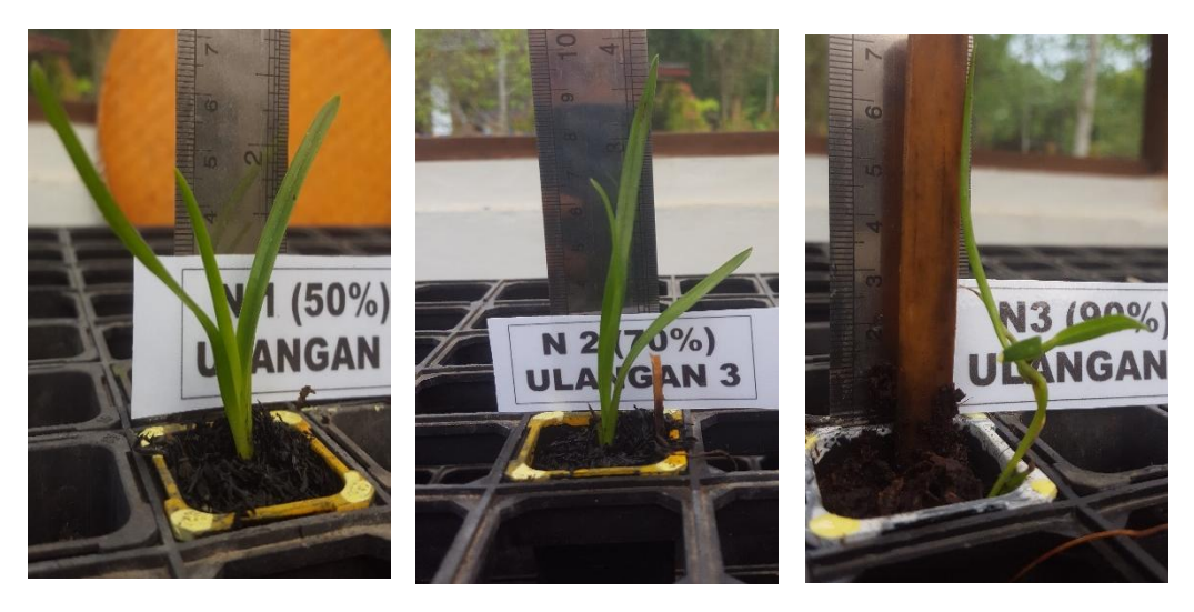
Figure no 1: Results of tiger orchid acclimatization at different shade levels

The effect of independent shade was significantly different on the number of leaves. In (Figure 1) it can be seen that plantlets of tiger orchids on paranet 90% with the same medium, namely husk charcoal, experienced growth disorientation. It was due to the light intensity at paranet 90% only 52 \mu mol m<sup>-2</sup> s<sup>-1</sup>.