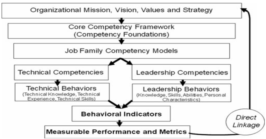
Figure 2. A Framework for Competencies (Campion M.A. et al., 2011)

Competencies must be typically linked to business objectives and strategies (e.g., Campion et al., 2011; Martone, 2003). The business objectives linkage of competency models is critical to the interest and commitment of senior management. In addition, the business linkage distinguishes competency models from job analysis, which usually stops short of translating how the competencies directly influence organizational goals. In order to ensure that the best practices are met, the development of the competency model often starts with a definition of the organizational goals and objectives. Based on the guiding framework, competencies critical for obtaining those goals and objectives are identified (figure 2). Sometimes the competencies are direct translations of the organizational goals. Other times, the competencies might be one step back in the chain of efforts required for the organizational goals, such as the identification of innovative new products. Note that this best practice does not preclude the inclusion of some competencies that relate to the fundamental requirements of organizations that are not necessarily linked to specific organizational goals, such as producing high-quality products or services. Competencies of this nature are more common for lower-level jobs, whereas competencies more clearly related to organizational goals are more apparent for management and executive jobs.