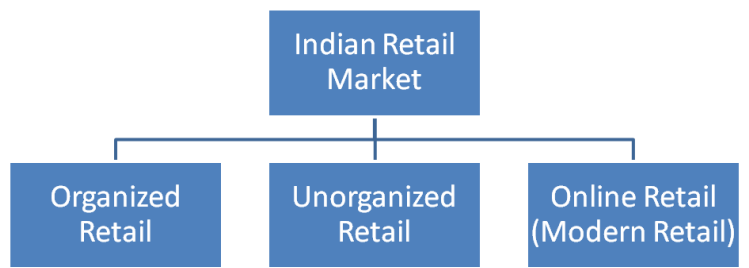
Figure1: Structure of Indian Retail Market

The environment of Indian market is dynamic due to the recent growth in information technology and frequent use of internet services. Indian top ten electronic retailers are Tata Croma, Reliance digital, Next retail India Ltd., Staples, e-zone by Future group, Viveks Ltd., Lotus, Terminal by Salora retail venture, Vijay sale. Retailing is the symbol of growth for Indian economy and 13% share in GDP. Total retail sector divide into two part organized and unorganized sector. Total 14 million outlets operate in India and only 4% of them being more being larger than 500 sq ft (46 m2) in size (InfoBharti.com). Organized retailing means trading activities operated by licensed retailers and those are registered for sale tax and income tax etc. that include hypermarket and super market retain chain and privately owned big retail business. Unorganized retailing means traditional format of low cost retailing, for example, mom & pop shop, general stores, corner shop, convenience stores and pavement vendors etc. and other format of retailing is online retailing that is big challenge for organized physical stores. Now people give more preference to online shopping rather than physical store shopping because it is more convenient. So, online shopping of electronic products is big risk for high invested organized physical retail stores. According to the time and requirement of customers the structure of retail industries are also changed here, we describe new structure of retail industry.