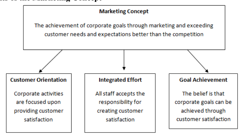
Fig 2.1 the Key Components of the Marketing Concept