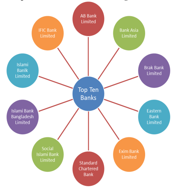
Top Ten Banks in Green Banking Initiatives

At present 214 branches of 26 banks are powered by solar energy. 23 branches of Islami bank, 16 branches of both Sonali & Al-Arafah and 14 branches of Mercantile Bank Ltd are using solar energy in their premises. Total 161 ATM/SME units of all commercial bank are powered by solar system energy sources other banks like prime, mutual, Bank Al Falah, Arob Bangladesh Bank have SME/ATM units used by solar system.