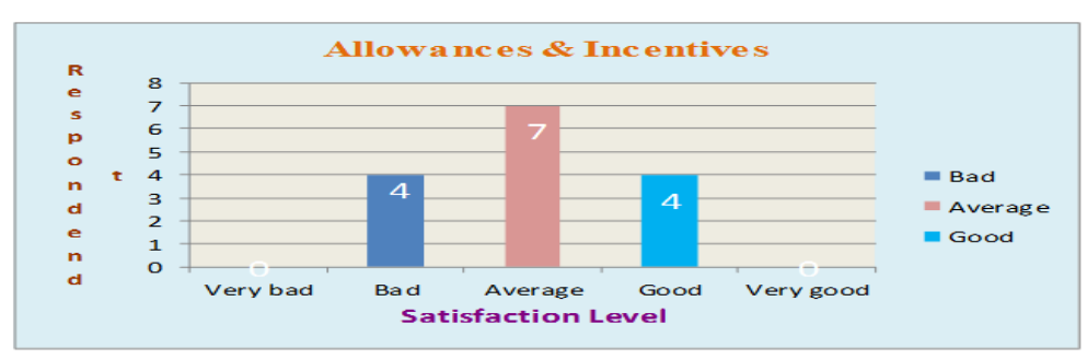
Figure 03: Job satisfaction with Allowances and others incentive