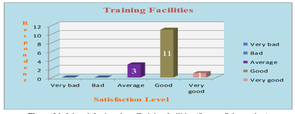
Figure 04: Job satisfaction about Training facilities

The chart shows the satisfaction level about Training facilities. It is apparent from the figure 04, at present the training facilities and programs of Janata Bank Limited is affordable, and it is nearly good. Among 60 respondents 12 showed their average level of satisfaction, 44 respondents said that it is good and rest of 4 respondents said that the Training facilities is very good. In 5 point Likert scale Table 10, shows the 3.87 Likert point which indicates the average level of satisfaction among the employees about Training facilities and it is also good. Table 11 shows an observation about promotion system.