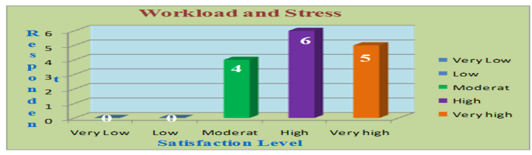
Figure 01: Job satisfaction about workload and stress

It is apparent from the figure 01, the workload and stress level in Janata Bank Limited is very high. Among 60 employees of Janata Bank Limited 16 respondents put their opinion about moderate level stress and workload, 24 respondents gave opinions about high workload and stress and rest of 20 respondents said that