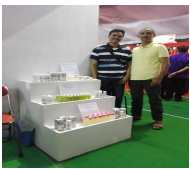
Figure 6: VCO Diversification Product Exhibition with the Koperindag Office, Trenggalek

Bina Sejahtera Desa Foundation, has a strong commitment in community empowerment in the Trenggalek Regency area, various community groups who get help in community empowerment efforts, the Bina Sejahtera Desa Foundation usually provides a place for training and the provision of participants in accordance with the needs associated with community empowerment efforts. As for this training the Bina Sejahtera Desa Foundation volunteered to help provide a training venue and involve the people in its formation to be invited to participate in marketing training activities and capital provided for those interested in participating directly in marketing the VCO Diversified Products produced. in areas that can be reached by the trainees. So this direct marketing training is part of the collaboration between the Ubhara Surabaya Team and the Bina Sejahtera Desa Foundation which has access to local residents and has a letterhead and a letter officially inviting the community to be trained and providing a training venue for the training to take place.