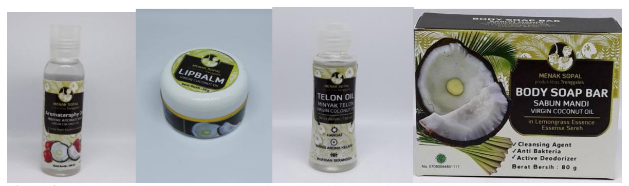
Figure 4: Various Products Variants resulting from diversification of VCO Products, with Menak Sopal Brands

The brand name comes from the original culture of the city of Trenggalek which needs to be preserved and socialized through the VCO Diversification product. The name of Menak Sopal is the founder figure of the Trenggalek district which is famous for its success in prospering the city of Trenggalek, to become a stand-alone Regency, which was formerly the area of Pacitan Regency and Tulungagung Regency. The trademark has become a label in the packaging of VCO Diversification products which are sold to various distributors and marketers who have been developing so far. The use of these trademarks has been cooperated with the CV. Budi Lestari as one of the sales partners for the Surabaya region and surrounding areas. In addition, later this trademark will be used for a variety of diversified products that will be made for various cosmetic needs and treatments made from VCO.