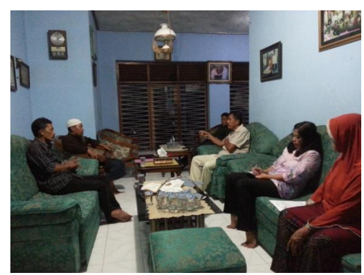
Figure 5: Coordination of Marketing Network Development with Partners

Marketing cooperation with the Bina Sejahtera Desa Foundation is also carried out in order to expand the market network for VCO Diversified Products. The marketing development, carried out for marketing at the local level in the South East Java region, includes Trenggalek, Tulungagung, Blitar, Kediri, Nganjuk, Ponorogo, Madiun and surrounding areas. This marketing cooperation, makes the development of this business wider and can become the intended market segments.