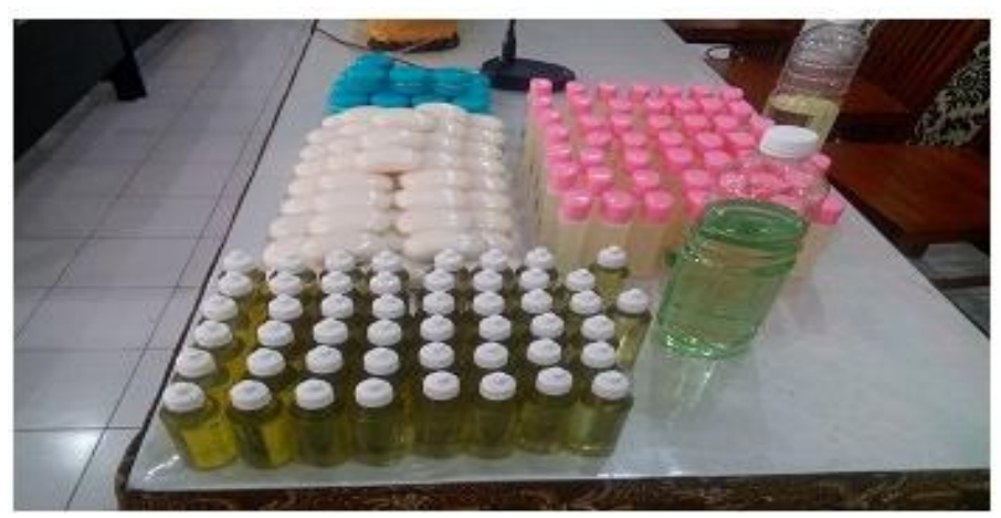
Figure 4: VCO Diversified Product Results

In the context of developing entrepreneurship in the manufacture of VCO Diversification products, to introduce VCO Diversification products to the market, collaboration is being developed with various parties, which while there are still many sales done by utilizing sellers freely and also developing institutional sales with various parties.: