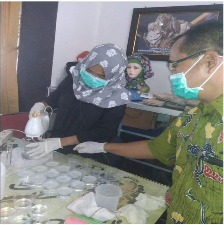
Figure 3. VCO Diversification Product Making Practices

The potential that can be developed from processed VCO products from research partners determined by the Regional Government of Trenggalek Regency has considerable potential, because the VCO products can be used not only for herbal medicinal purposes, but can also be developed diversified processed products in the form of soap, telon oil, massage oil and lip blam if produced according to standards and quality is maintained and the packaging is attractive both in terms of appearance and shape as well as various scent variances, then this potential can be developed by being introduced outside the Trenggalek area to foreign countries. This VCO processed diversification product will be made by Brand Image that illustrates the cultural characteristics of Trenggalek culture, namely Sop Sop Culture by the Research Implementation Team in the regional superior product development program carried out by the Bhayangkara University Research Team in Surabaya with funding from the Ministry of Research and Technology Republic of Indonesia.