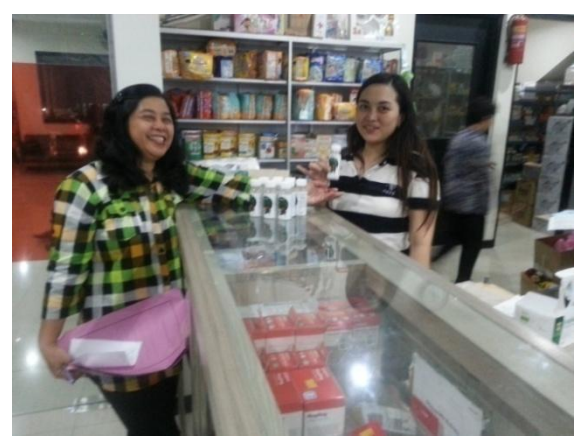
Gambar 6: Survei Pemasaran pada Agent