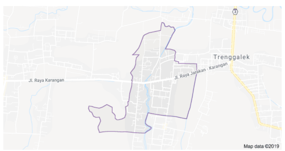
Figure 1: Map of Sumberingin Village

Southern Side: Sukowetan Village West side: Kedungsigit Village