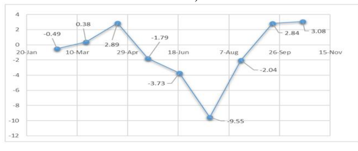
Figure 4 Monthly Change Rate In Maize Prices For The Second Period After The Pandemic (November 2019 – July 2020)

Table 11 data show that monthly change rate in maize prices for the second period after the pandemic (November 2019 - July 2020) has reached its maximum level in July 2020 scoring around 3.08%, and hit the minimum level in April 2020, scoring around -9.55%, as shown in diagram 4.