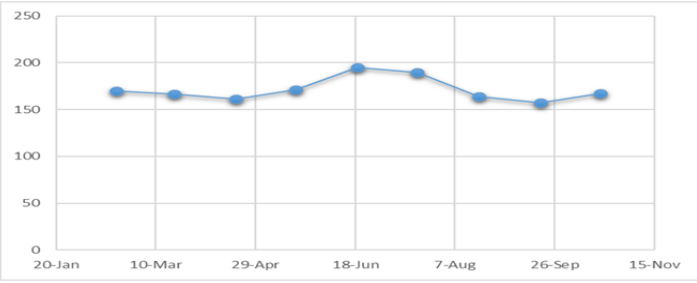
Table 11 data show that monthly change rate in maize prices for the first period before the pandemic (February 209 – October 2019) has reached its maximum level in June 2019 scoring around 14.03%, and hit the minimum level in August 2019, scoring around -13.64%, as shown in diagram 2.