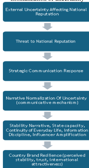
Figure 3. Refined conceptual framework of country brand resilience highlighting the mechanism of narrative normalization of uncertainty

In this perspective, the communication frames identified in the analysis can be interpreted not as isolated narratives, but as coordinated expressions of a broader communicative mechanism aimed at stabilizing perceptions of the national environment. This mechanism is illustrated in Figure 3, which conceptualizes these frames as part of a process of narrative normalization of uncertainty linking strategic communication to country brand resilience.