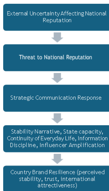
Figure 1. Conceptual framework of country brand resilience.

Figure 1 illustrates the conceptual framework guiding this study. The model suggests that external uncertainty may generate potential threats to national reputation. In response, institutional actors deploy strategic communication narratives that reinforce perceptions of stability, institutional competence, and continuity of everyday life. These coordinated communication practices contribute to strengthening the resilience of the country brand.