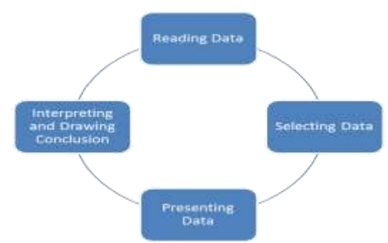
Figure 3: The Constructive Method of Data Analysis

According to Taylor (2002) data analysis starts focusing the collected through questionnaire, interview, observation and notes taken on teaching journal.