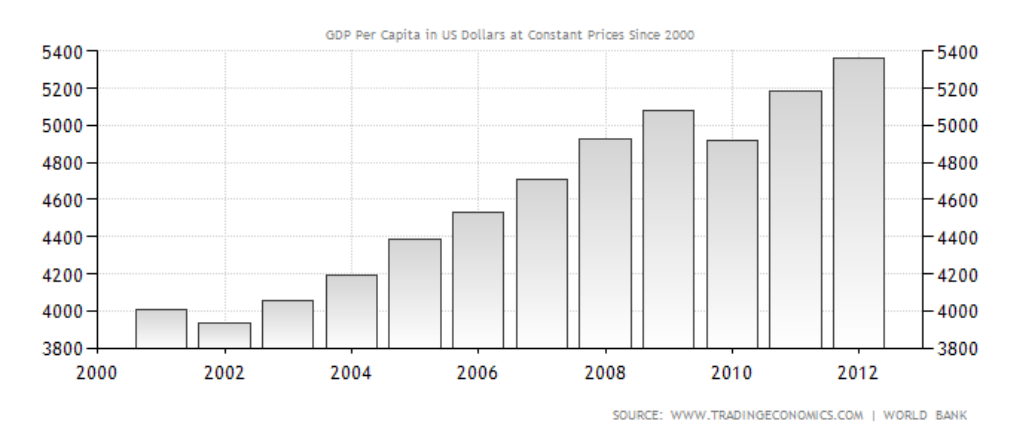
Chart 1 Libyan GDP per Capita.

bank collateral. Corporate incomes and cash flows also declined, leaving some corporations unable to service their debt.