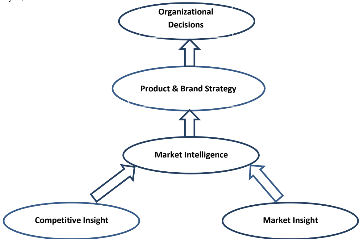
Fig 3: Relationship between market intelligence & decision making

Market intelligence stages help businesses complete this increased vacillation by taking responsibility for strategic analysis. Organizations are utilizing methods such as competitor analysis, situation analysis, trends analysis, and so on.