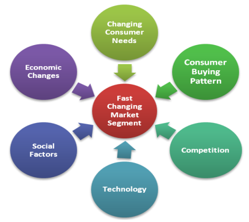
Fig 1: Factors affecting fast change in market segment

Traditionally demographic traits such as age, sex, education levels, and income were key for market segmentation which are now no longer adequate to oblige as a foundation for product or brand strategy. Consumer buying decisions are getting influenced by the non-demographic traits such as values, preferences and tastes not by their demographic traits. These changes and the strategy formation depend on the segment those appear more promising for specific brand or a product but this is turning untruthful for most of the organization in recent times.