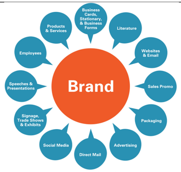
Fig 3: Factors in brand strategy

Due to effect of globalization and technology developments companies are facing many challenges for brand strategy development. Consumers are becoming wiser & accessing to real time information than ever before. Use of cloud technology has given the boost to reach to many people simultaneously. This type of broadcast over Internet showcases product information proliferate raising expectation bar for companies. Organizations offer multiple products or services in selected market segment, many competitors follow the same. The identity developed for this product and services over a period of time, through marketing, robust performance etc. is referred to as brand strategy. It's the image that is created & properly positioned by the organization in the minds of customer or targeted for group of customer segments. A time comes where stage arrives where product name itself becomes brand e.g. - coffee-Café Coffee Day, donut-Dunkin Donuts, online retail-Amazon, etc.