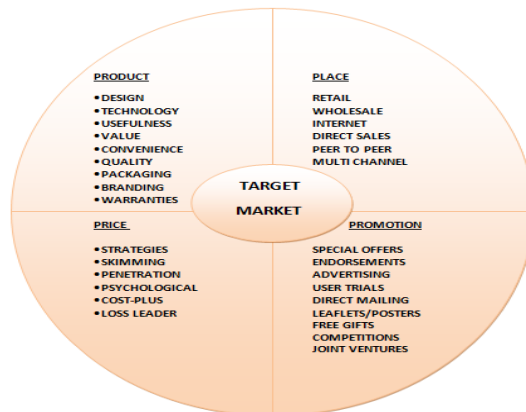
Fig. 1 Marketing Mix Cycle

constitutes the core of company's style of marketing. All these elements are very significant and depend upon each other; the four elements in the marketing mix are inter related.