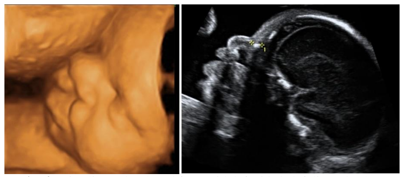
Fig. 4: Timeliness developed fetus with left-sided cleft lip and palate

Clefts in unborn babies are often detected with an ultrasound examination during a routine antenatal appointment. This antenatal scan typically takes place at around 20 weeks ( FIG 4 ). The accuracy of sonography for prenatal diagnosis of cleft lip and palate is highly variable and dependent on the experience of the sonographer and the type of cleft. Reported rates of detection for cleft lip and palate range from 16% to 93%. Isolated cleft palate is rarely identified prenatally. Furthermore, even when a cleft lip is visualized sonographically, it is difficult to determine whether the alveolus and secondary palate are also involved.[4]