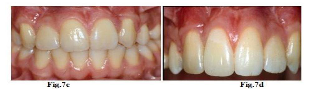
Fig 7a-d: Space closure of the region of missing maxillary lateral incisor by orthodontic mesialization of posterior teeth at the cleft side