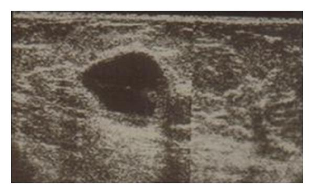
Figure 2 USG of right breast showing a cystic lesion

Specimen (Figure 3) was sent for histopathological examination. Specimen received was 5x3 cm and was lipomatous. The cut section showed cystic structures measuring 5x3cm filled with serosanguinous material. Permanent sections revealed a dilated duct with papillary structures protruding into the lumen. These papillary structures had fine fibrovascular cores and were covered with multilayered cells showing prominent nuclear pleomorphism and brisk mitotic activity (Figure 4).