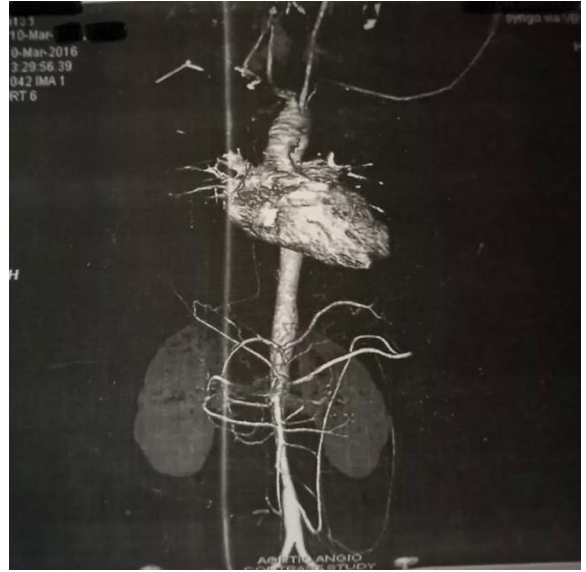
descending abdominal aorta.

Management : Multidisciplinary approach was adopted in the management. Emergency lower segment caesarean section was performed in view of non reassuring fetal status.