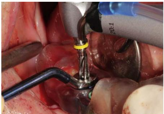
b) Universal Guide