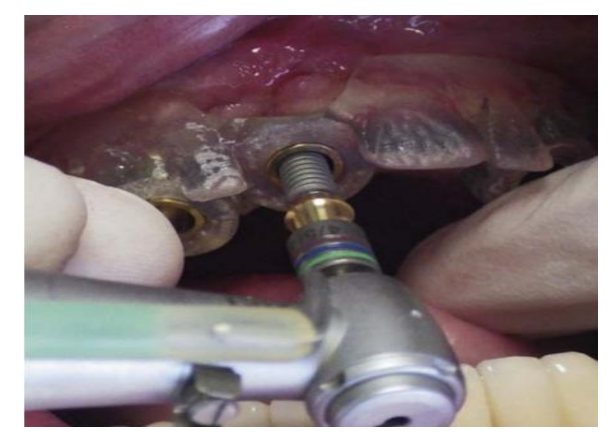
c) Fully Guided