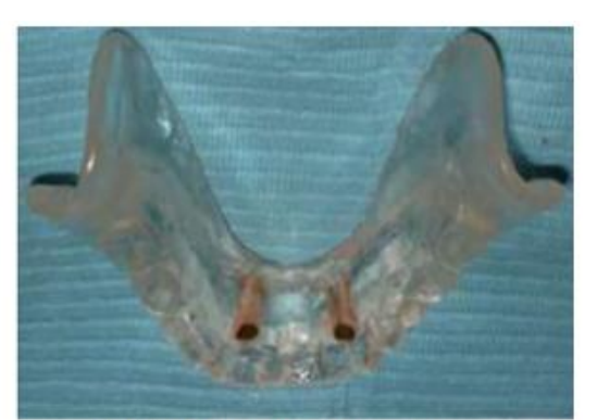
b) Lab Constructed Template