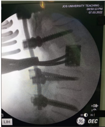
Figure 2 Intra operative image showing Expandable cage at L2