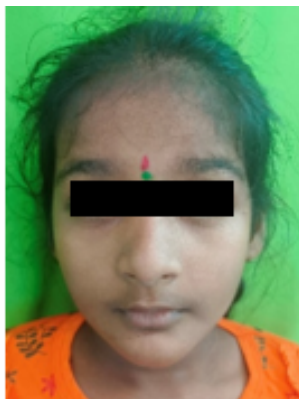
Fig.1. Extraoral examination of the patient.