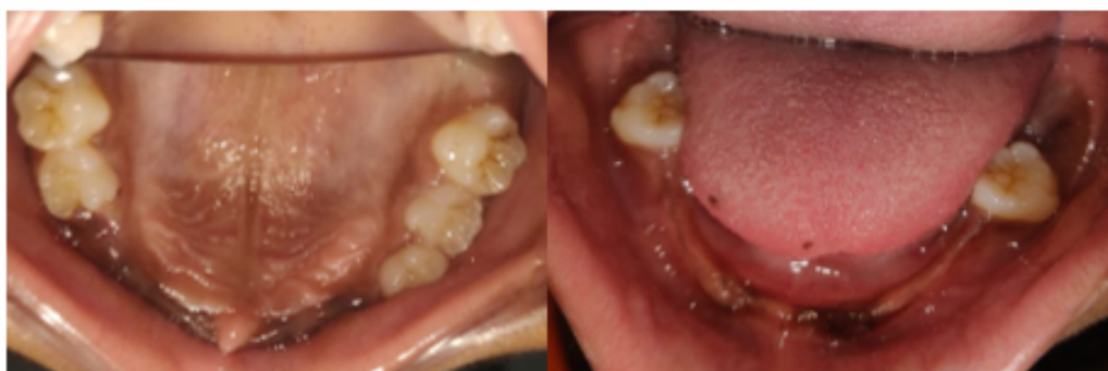
Fig.2b. Multiple missing teeth, normal crown morphology and colour