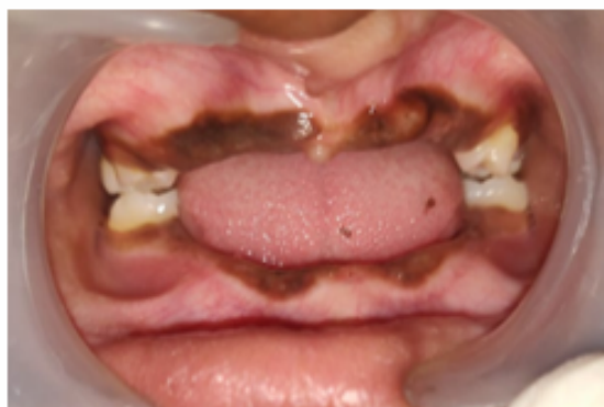
Fig.2a. Representing missing teeth and erupted 55, 16, 64, 65, 26, 75, 85