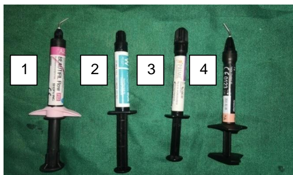
1.Beautifil , 2.Waldent , 3.Prime , 4.ivoclar

This is an experimental laboratory study. The study population included four groups of flowable bulk-fill composites. The sample size was set at four for each composite Bulkfill-flowable composites (figure 1)