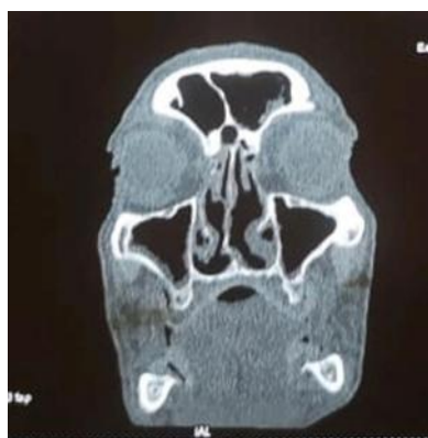
Figure 2: Blondeau CT scan confirms chronic sinusitis