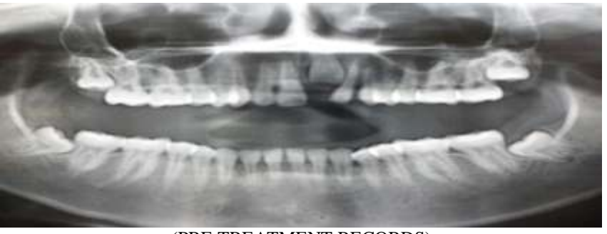
(PRE TREATMENT RECORDS)