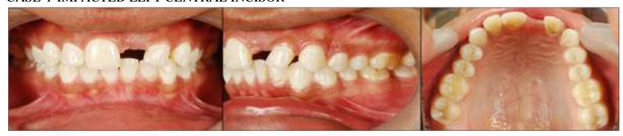
II. Clinical Case Series Showing Team Work With Orthodontics A.ORTHODONTICS, ORAL DIAGNOSIS AND ORAL SURGERY COLLABORATION CASE-1-IMPACTED LEFT CENTRAL INCISOR

With the team approach, herewith we are presenting a few cases showing the ultimate outcome with the help of team work.