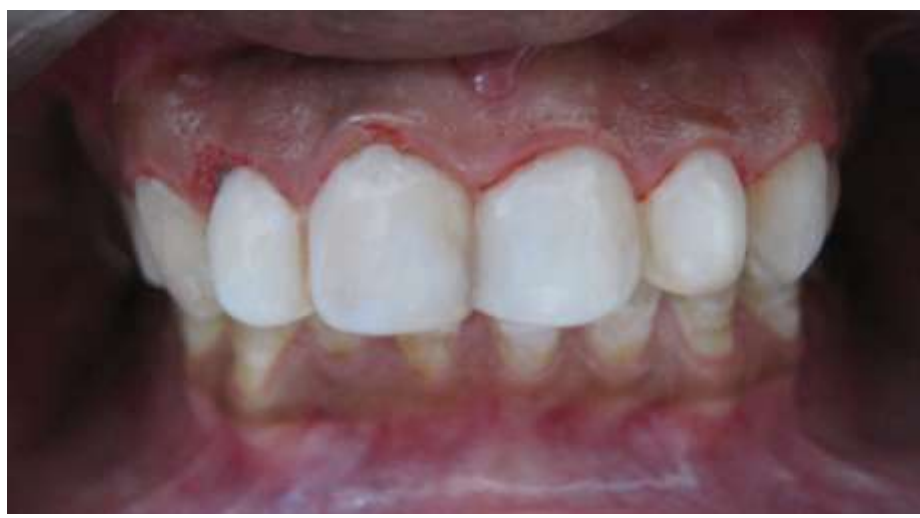
(FOLLOWING COMPOSITE VENEERING OF SIX ANTERIOR TEETH)