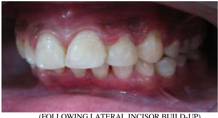
(FOLLOWING LATERAL INCISOR BUILD-UP)