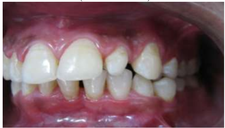
(FOLLOWING ORTHODONTIC TREATMENT)