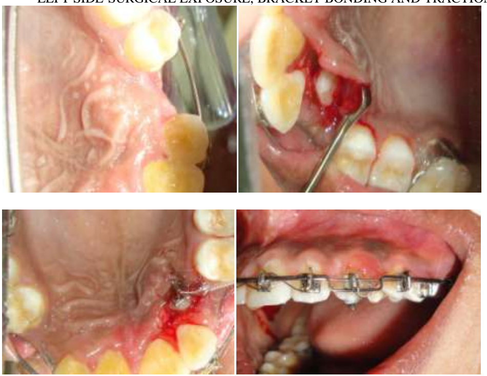
RIGHT SIDE-SURGICAL EXPOSURE, BONDING AND TRACTION

LEFT SIDE-SURGICAL EXPOSURE, BRACKET BONDING AND TRACTION