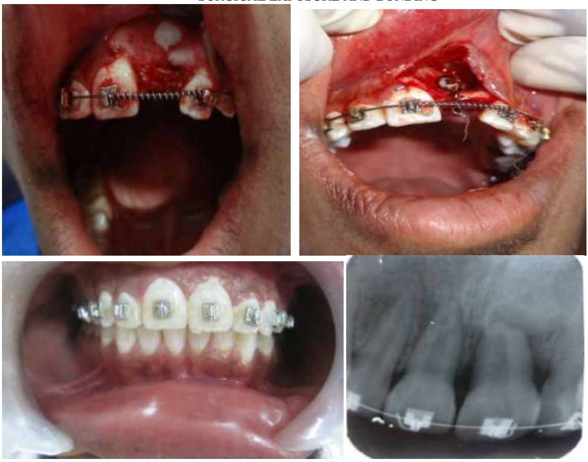
AFTER TRACTION OF IMPACTED INCISOR