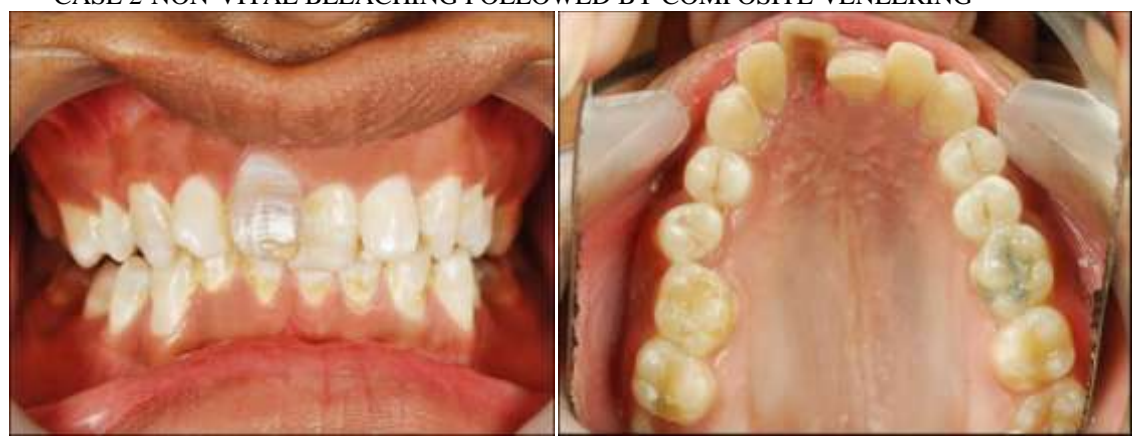
(PRE TREATMENT PHOTOGRAPHS)