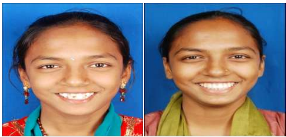
PRE-TREATMENT SMILE POST-TREATMENT SMILE C.ORTHODONTICS-RESTORATIVE DENTISTRY TEAM-WORK CASE-1; AESTHETIC BUILD-UP OF PEG-SHAPED LATERAL INCISOR BY COMPOSITE-