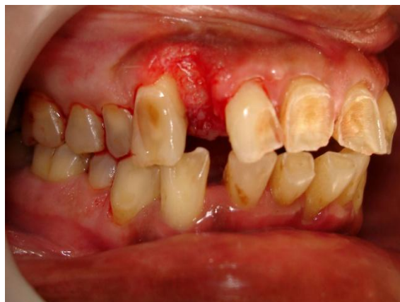
Figure 2: Immediate post operative view