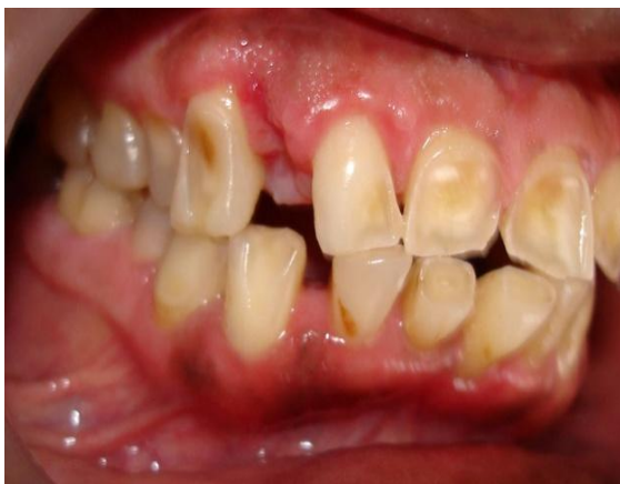
Figure 3: One week Post-operative view