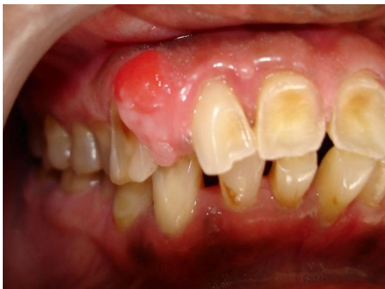
Figure 1: Pre-operative view