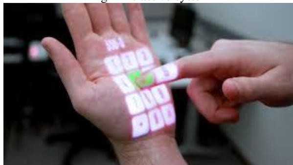
Fig-1 Intractive system

An interactive whiteboard (IWB),(fig-1) is a large interactive display that connects to a computer. A projector projects the computer's desktop onto the board's surface where users control the computer using a pen, finger, stylus, or other device. The board is typically mounted to a wall or floor stand. They are used in a variety of settings, including classrooms at all levels of education, in corporate board rooms and work groups, in training rooms for professional sports coaching, in broadcasting studios, and others.