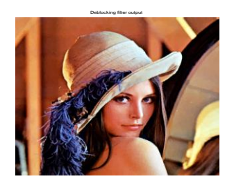
Figure 7: Deblocking Filter

The Figure 6 shows the Output image ,the output image is compressed to the input image. The file size is decreased to the input image the size is about approximately 30,000